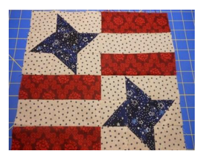
12 inch finished block